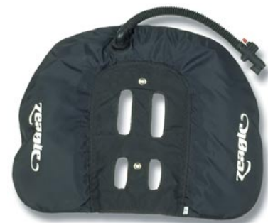
Manta Wing for Backplate use: (Single 50 lb. bladder) 7014DR

Zeagle's backplates will mount to any of our twin capable BC's, or they may be used with any