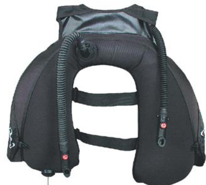
Dual redundant Bladder Assemblies inside a single outer cover: "Big Bertha" (Dual 85 lb. bladder) 7724 "Little Bertha" (Dual 55 lb. bladder) 7725