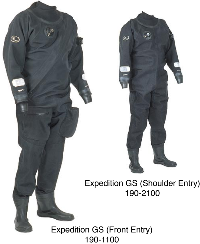
Expedition GS (Shoulder Entry) 190-2100