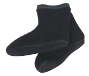
Neoprene Socks 194-5218