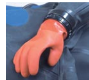
Dry Glove Kit (Requires Cuff Rings) 194-6150