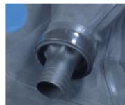
Cuff Rings 194-5230