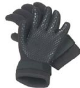
Gloves 3mm 194-6100 6mm 194-7100