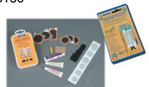
Drysuit Repair Kit 197-1300 Patch Adhesive 197-1350