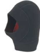
Neoprene Hood 194-5100