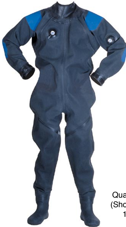
Quad Laminate (Shoulder Entry) 190-6100