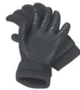
Gloves 3mm 194-6100 6mm 194-7100