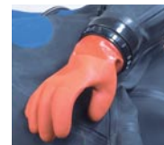
Dry Glove Kit (Requires Cuff Rings) 194-6150